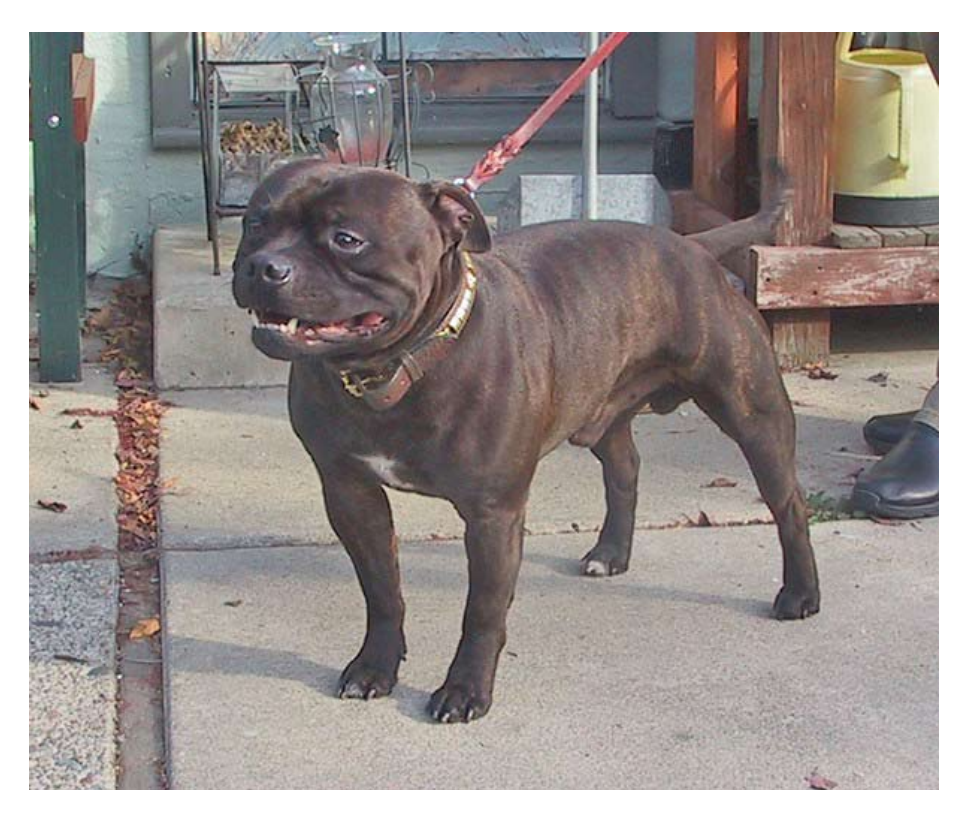
Zorro, two year old South African import.

11th.) The occasion greatly reminded me of Stafford rallies the late sixties when we had all of about 60 Staffords in the whole country, concentrated mainly in southern California.